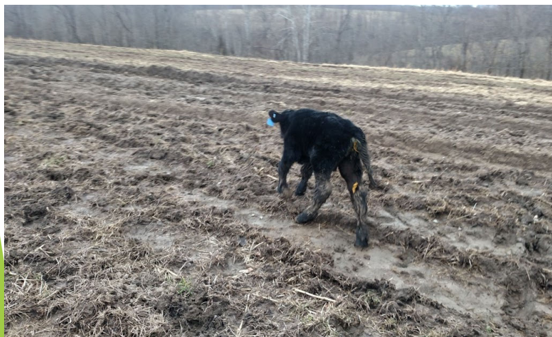
Project #3 Before