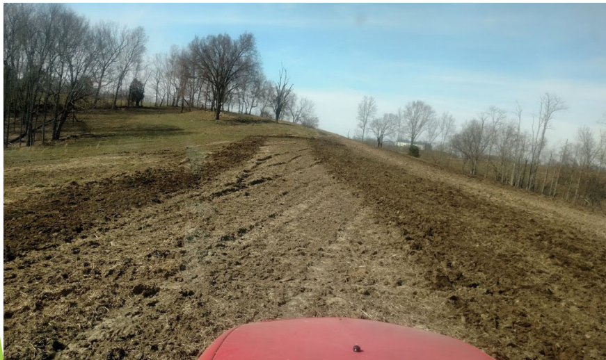
Project #2 Before