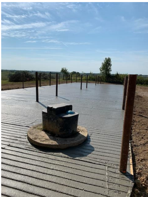
Project #4 In Progress