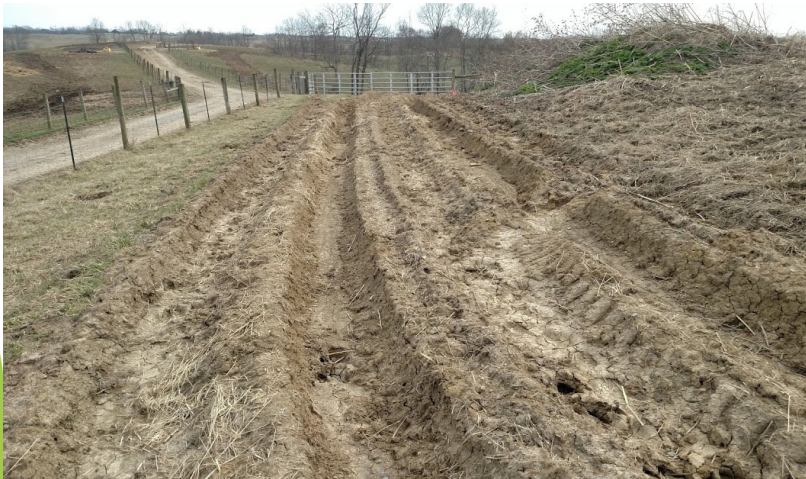
Project #1 Before